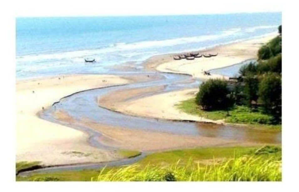
Rivers after the journey is completed meet the Ocean. When it reaches to ocean tits duty is over. Relaxation may come after reaching the destination.

This image will be helpful to understand about Yoga. Some other discussion available in poetry, folksongs, Baul Songs, stories, paintings, photographs etc. may also be included here. There are so many creativities just to highlight this meeting or eagerness for this meet or being sad being unable to meet.